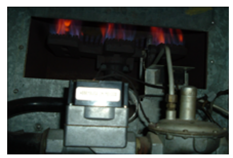
Rusted and corroded gas burners.

Although the system was operable at the time of inspection, replacing the system will significantly improve energy savings.