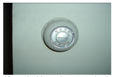
Upgrade this analog manual unit